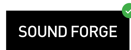
Application in white