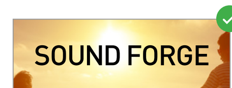
Use for photos (be aware of contrast)