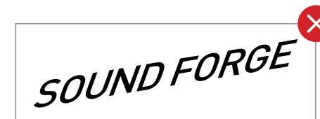
Do NOT rotate or compress